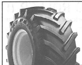
TRU POWER II