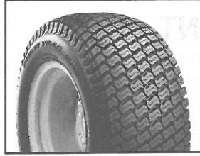
MULTI TRAC C/S