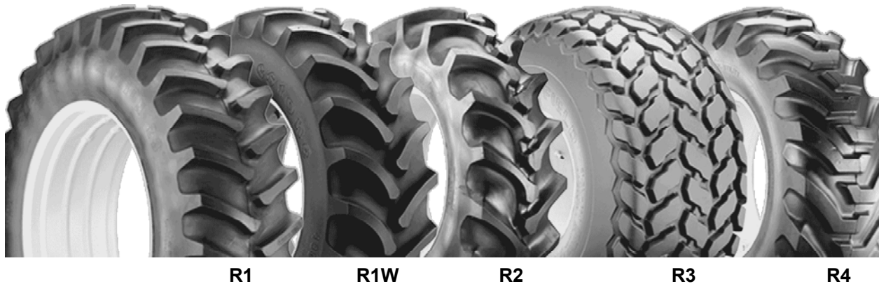
Figure 9. Basic drive tire tread patterns.

R1 tread is used for general farming and typically provides the best traction in most soil conditions. The tread is an aggressive pattern for developing traction in hard to soft soil conditions. The tread void area is approximately 70% of the total footprint for good cleaning in wet soils and good penetration in firmer soils.