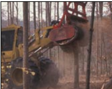
High lift boom for mulching large, standing trees.