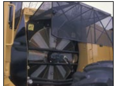
The automatic variable speed fan improves fuel efficiency.