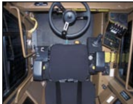
Spacious, comfortable cab. Joystick steer or optional quick wheel steering.