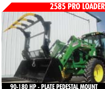
2585 PRO LOADER

Not all features available on all loader models. Contact Koyker Manufacturing for more details.