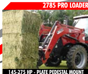
2785 PRO LOADER