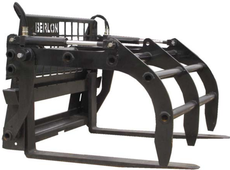
Fully Closed Position Shown Here