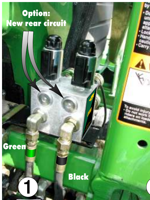
1 Route kit supplied hoses under loader post