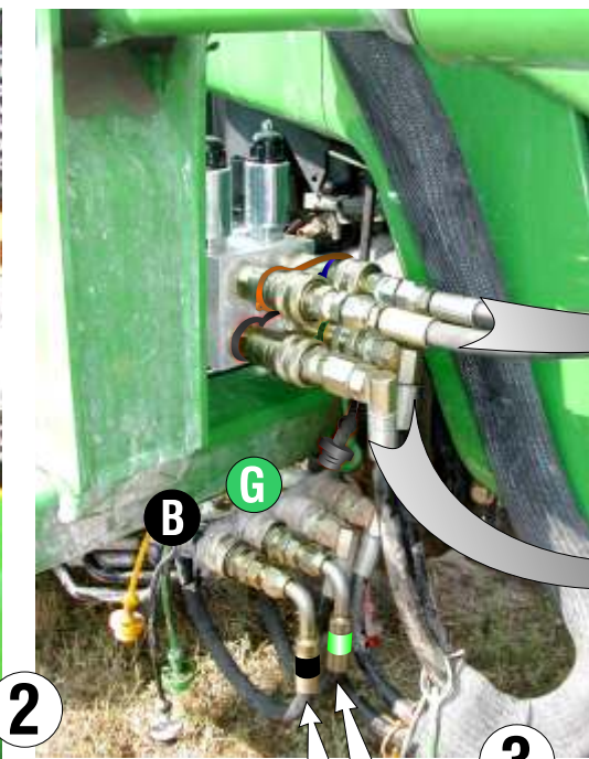
2 Hook-up the two supply hoses to "SCV" ports.