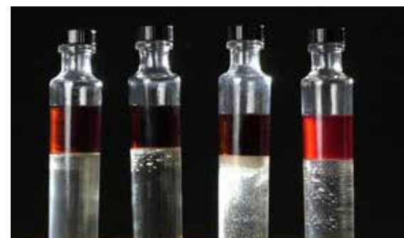
Brand E Brand F Brand G CenPeCo