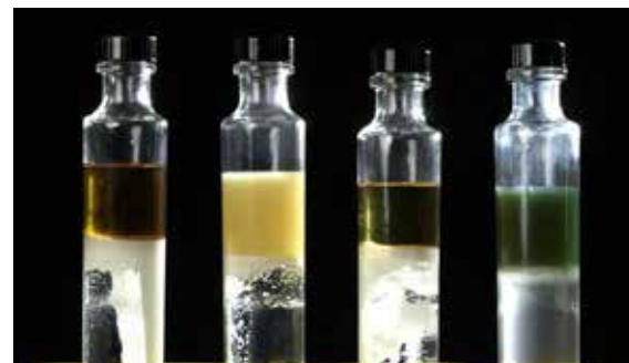
Brand A Brand B Brand C Brand D

Water contamination is a fact of life in heavy-duty equipment. That's why you need a fluid that stays stable when it comes into contact with water. Fluids that fall apart or experience additive dropout in the face of water contamination can yield insoluble materials that block filters and inhibit oil flow. Cen-Pe-Co Multi-Purpose Hydraulic & Wet Brake Oil is designed to resist interaction with water, protecting against hydraulic system failure and keeping tractors running, reliably.