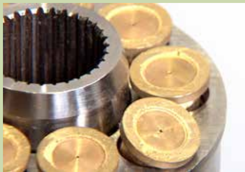
Good/bad piston shoes

Cen-Pe-Co Multi-Purpose Hydraulic & Wet Brake Oil offers a high degree of water tolerance, protecting yellow metal from damaging scratches and corrosion.