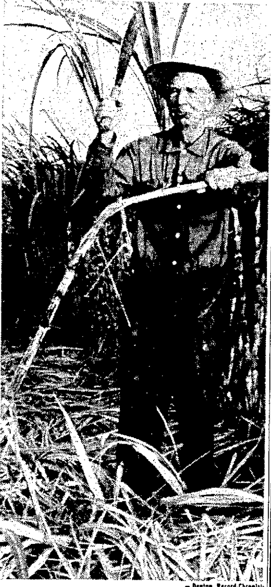
CUTTING, TRIMMING CANE FOR SYRUP MILL Inman Wields The Cane Knife