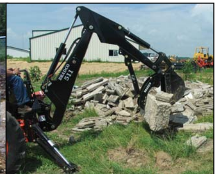
511 with Knuckle Arm